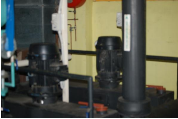
CONDENSOR WATER PUMP